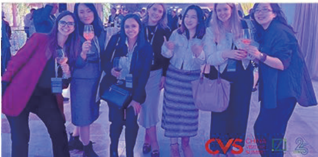
El Olivar Evening Reception & Party