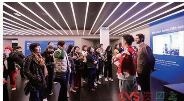
Visit Mirador Torre Glories