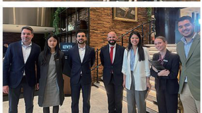
Visit Meliá Madrid Princesa Hotel and The Westin Palace, Madrid