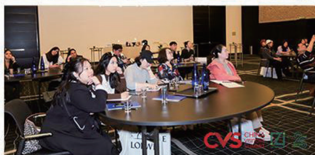
Visit Hilton Madrid Airport and Ocean Drive Madrid