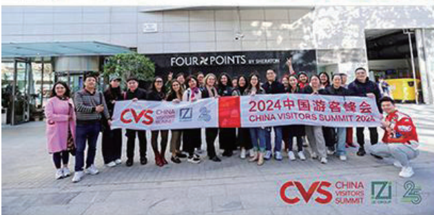
Visit Four Points by Sheraton Barcelona Diagonal and Hotel Arts Barcelona