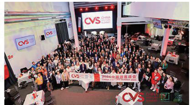
Continued face-to-face appointments solidified partnerships and facilitated new agreements.