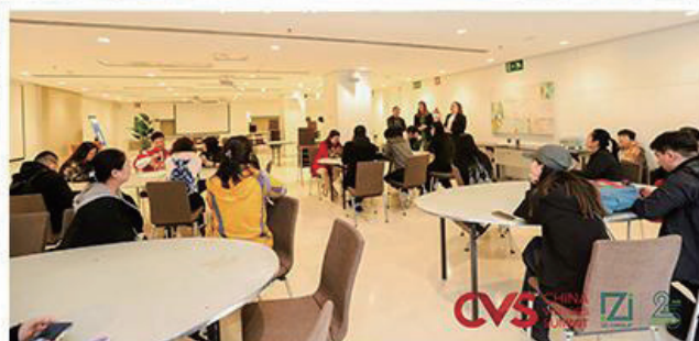
Visit Ocean Drive Barcelona Hotel and Renaissance Barcelona Hotel