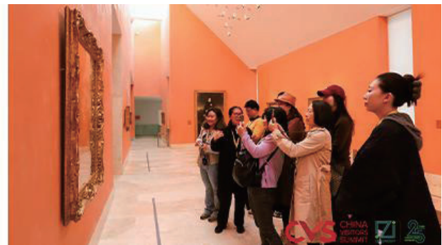
Visit Museo Nacional Thyssen-Bornemisza