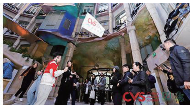
Visit Casa Milà & La Pedrera