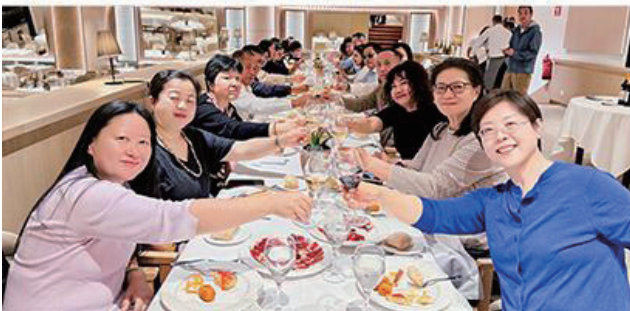
Visit Melia Castilla Hotel, Thompson Madrid - Part of Hyatt and Hyatt Centric Gran Via Madrid