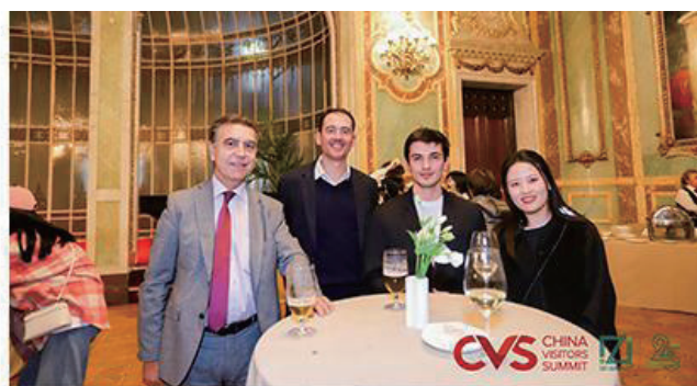
Welcome Dinner event by Madrid Tourism and Madrid Convention Bureau at REAL CASINO DE MADRID.